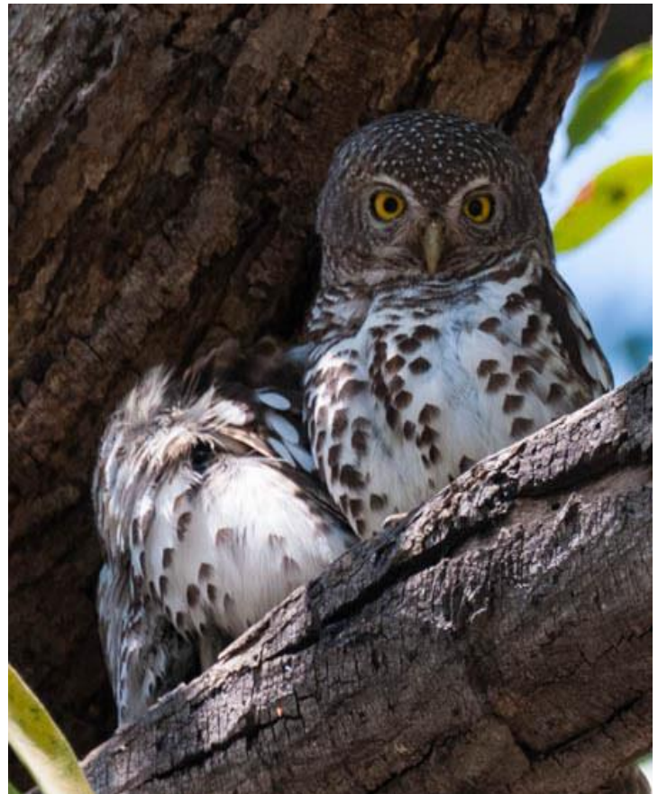
African Barred Owlet