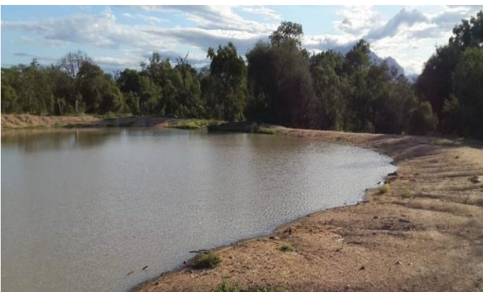
Lente se dam