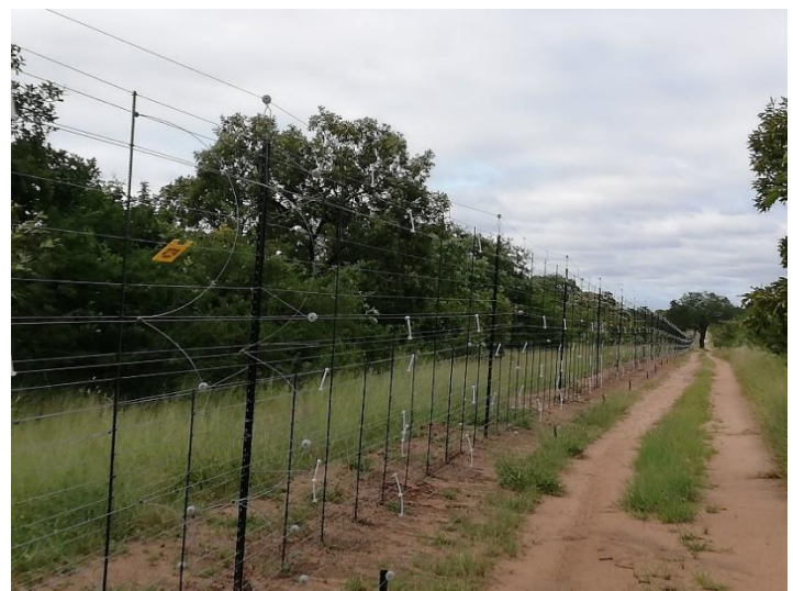
Upgraded fence – Moditlo / Scotia

Phase 1 which was the 900 meters, between Moditlo and Scotia was recently finished.